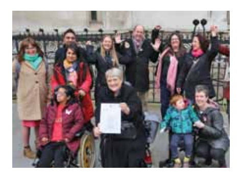
"Contact supported our campaign through the Disabled Children Partnership."

"The swings were installed in the parks along with a wheelchair accessible roundabout and trampoline, much to the delight of Mia and many other children."