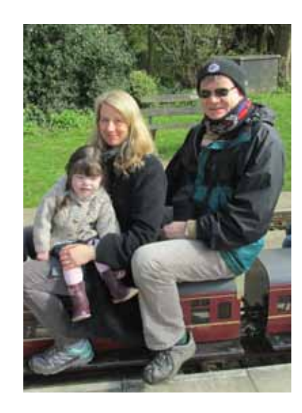
"Contact helps us as parents keep fully informed of everything going on related to caring."

Recognising the challenges your disabled child has overcome that fill you with pride and make you smile.