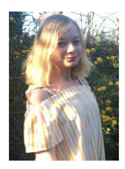
because she doesn't let her rareness get in the way of living a selfless life."

Recognising a child or family with a rare condition and how they champion being rare.