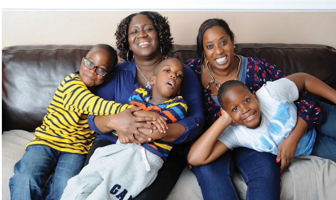
Picture of family on the sofa