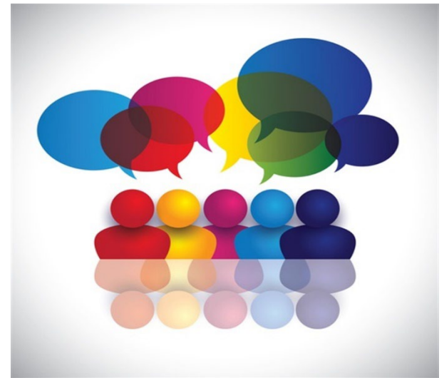
Picture of people with speech bubble