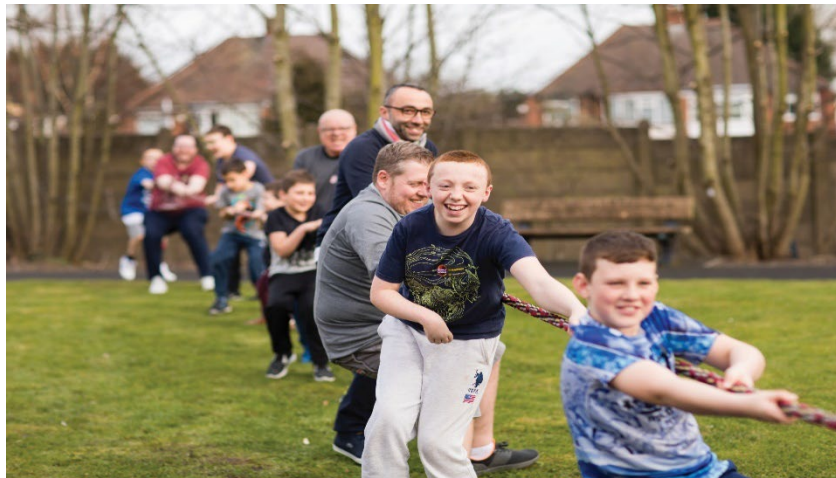
Picture of families playing tug of war

The best possible opportunities and futures for all children and young people with special educational needs and disability (SEND) and their families.