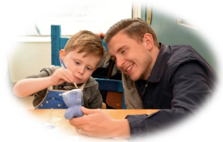
Picture of Father and Son

And we help families to campaign, volunteer and fundraise to improve life for themselves and others.