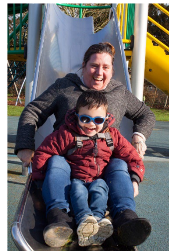
Picture of Mother and Son