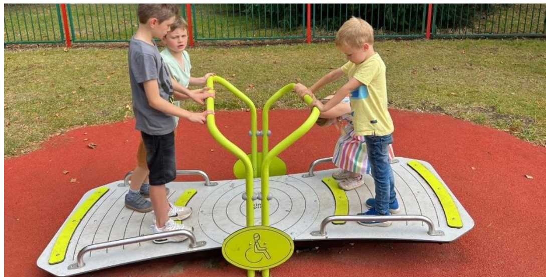
Bedford Borough PCF - Inclusive playparks