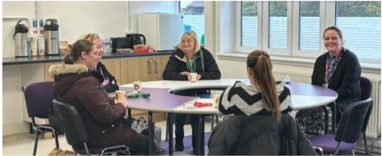
Wigan PCF - Autism in Schools project