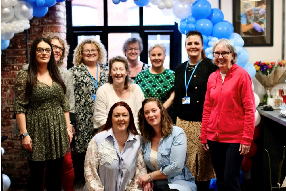
Rochdale Parent Carers Voice 21 st birthday