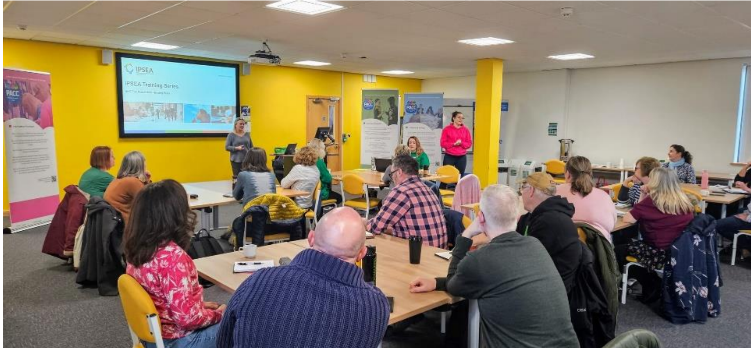
PACC Shropshire – IPSEA training