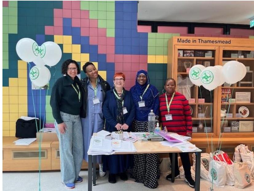
Greenwich PCF – Videos for those awaiting autism diagnosis