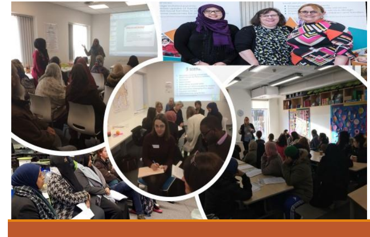
Tower Hamlets PCF mental health support, training, and guide