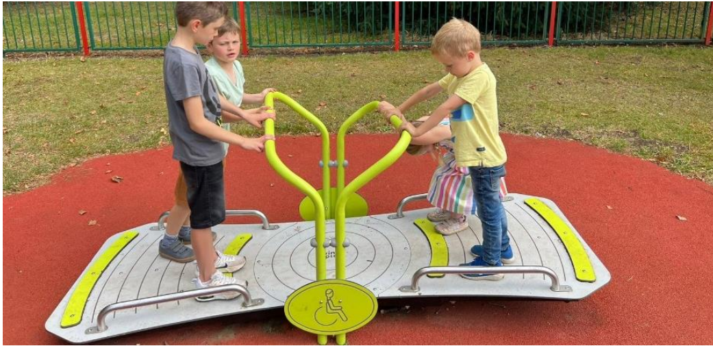
Bedford Borough PCF - Inclusive Playparks