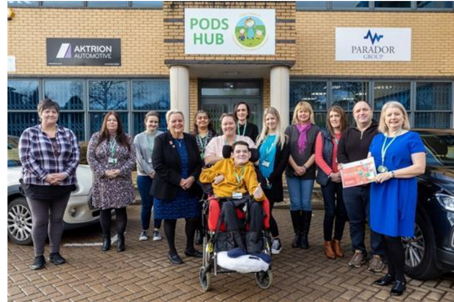
PODs Telford and Wrekin - Waiting Well project