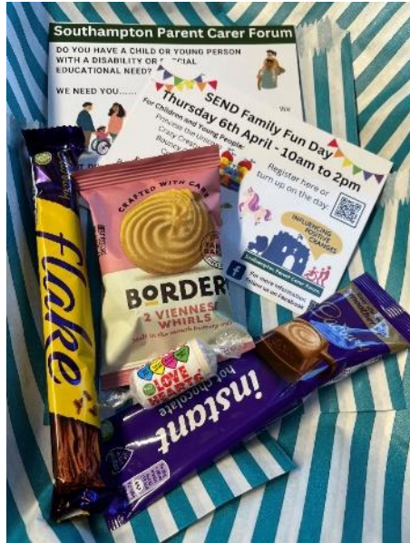
Southampton PCF – Beat the Blues Bags