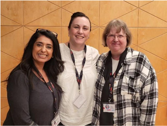
South Glos Parent Carers – Emotional Based School Avoidance guidance for schools