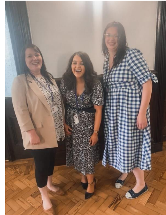
SENDAC – (SEND Alliance Cumbria) recruitment and retention videos