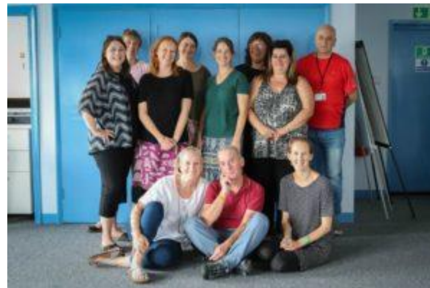
PACC Brighton & Hove – working with the Traveller community