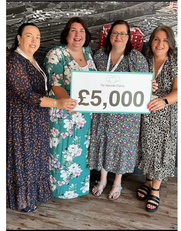
Stockton PCF win £5,000 at Teesside Charity's Golden Giveaway