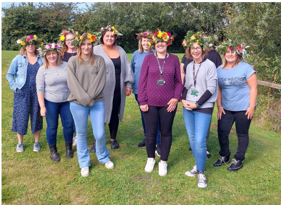
North Somerset Parent Carers Working Together – Enhanced support offer