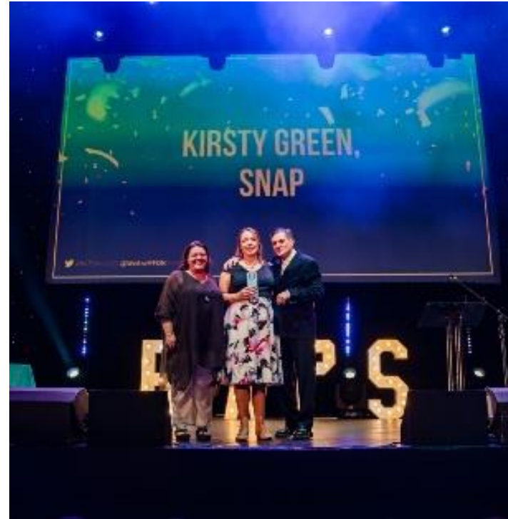
SNAP – PDA guidance and Embedding Therapeutic Thinking in schools