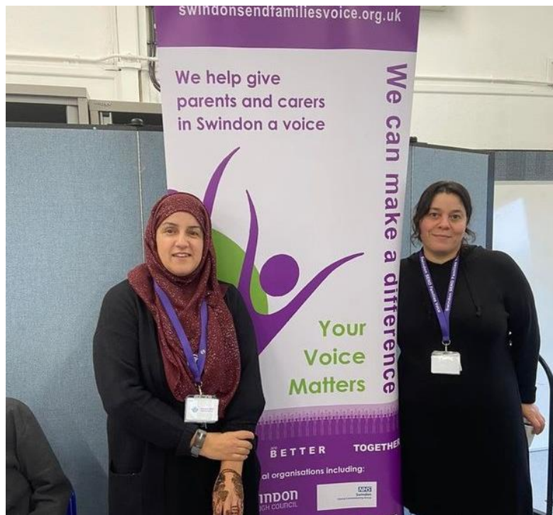
Swindon SEND Families Voice - Reshaping Conversations