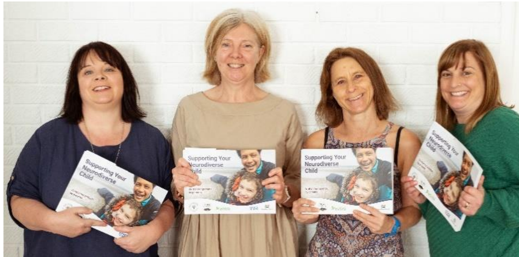
Essex Family Forum – Supporting your Neurodiverse Child