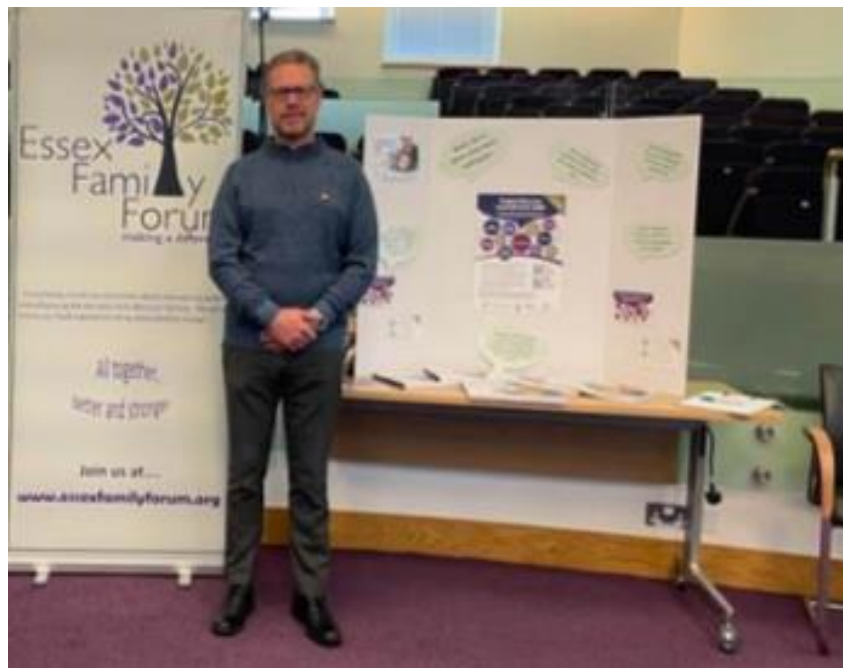
Essex Family Forum - Graffiti wall