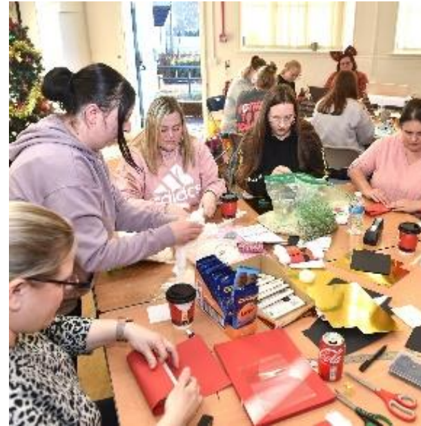
Stockton PCF - crafting days