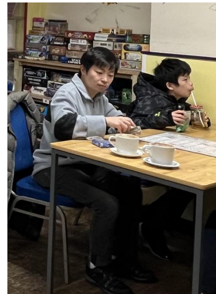
Southampton PCF – Relaunch and reaching out projects