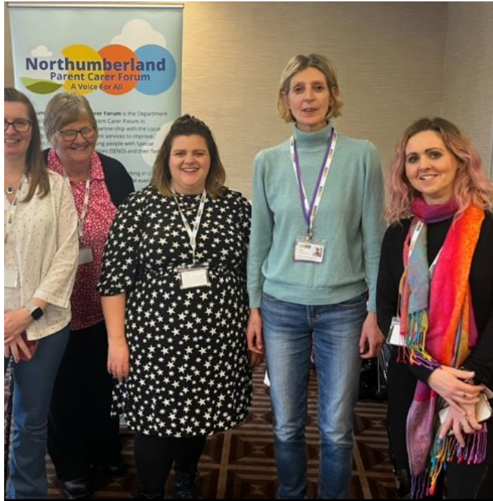
Northumberland PCF - SEN summer holiday activity brochure & OT Sensory Processing Service and website