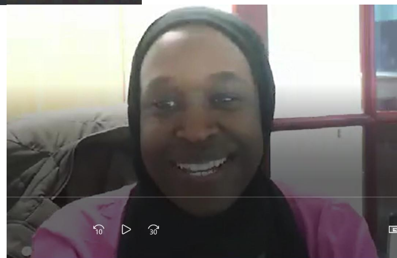
Family Voice Peterborough – Reaching out to Communities