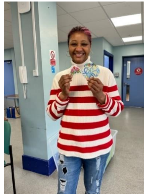
Lewisham PCF - pampering days and warm hubs