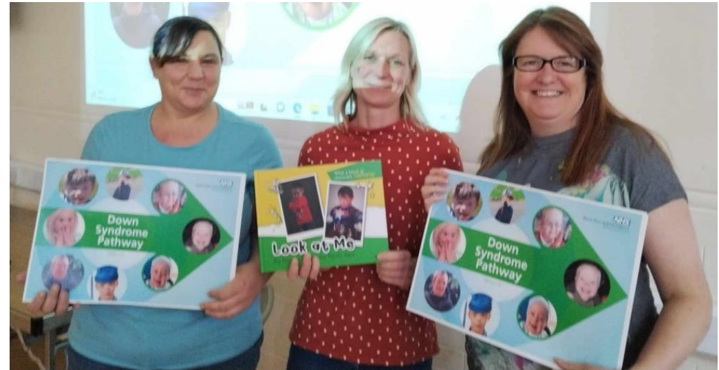
Stockton PCF – Down Syndrome Pathway Design