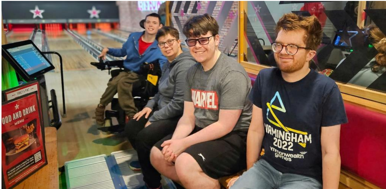
PACC Shropshire – PFA Navigators and Buddies Projects