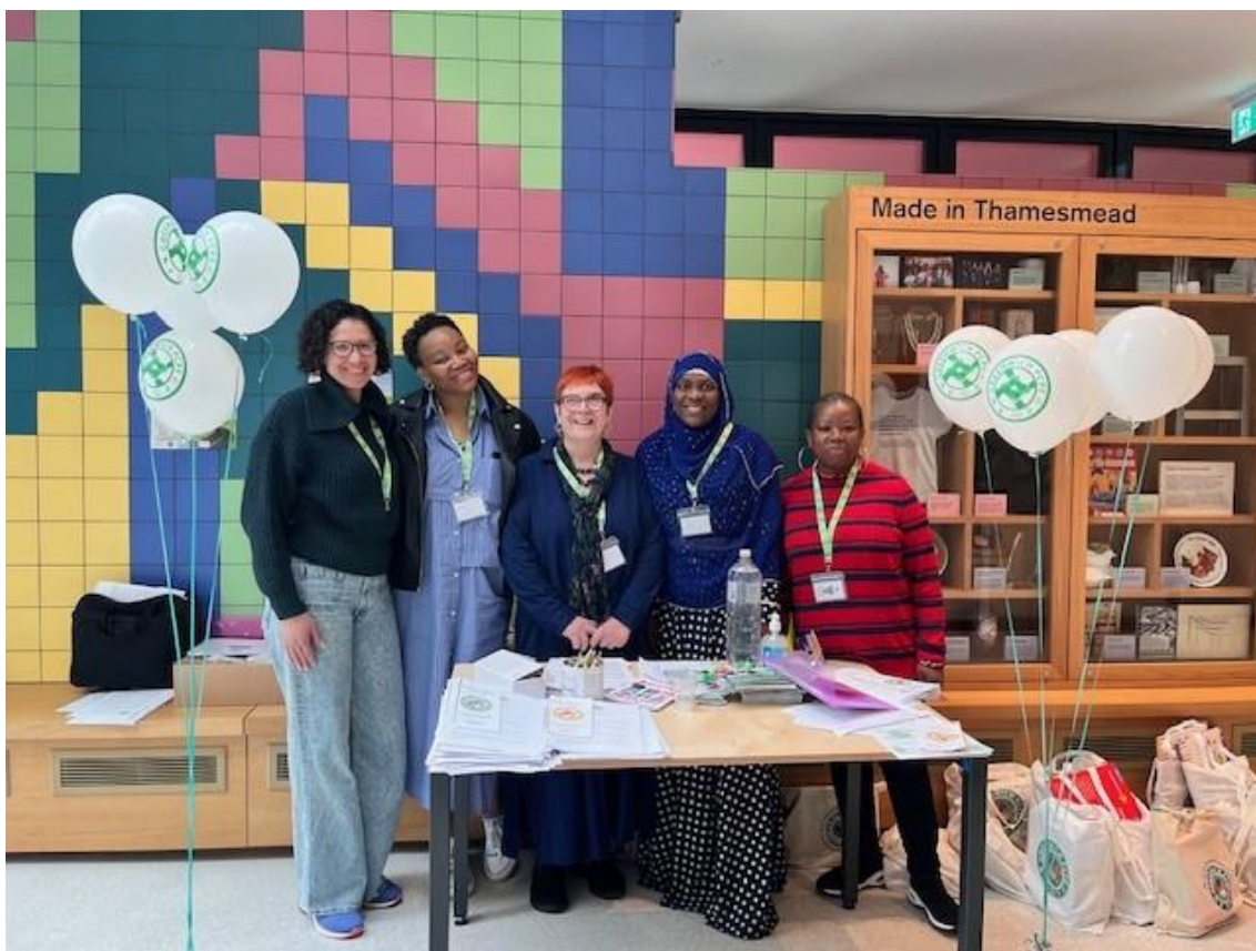
Greenwich PCF - Parent Champions