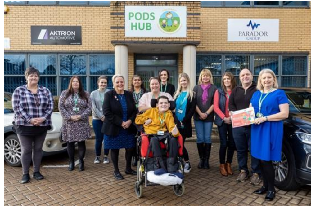
PODS Telford and Wrekin - Waiting Well project